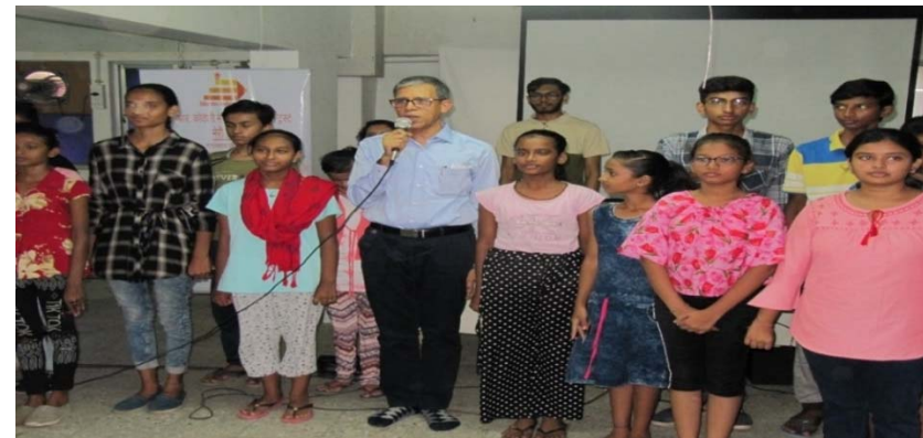
National anthem in trust program