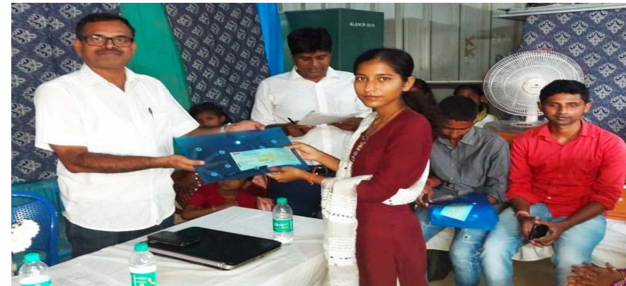
Scholarship Distributed to trust beneficiaries