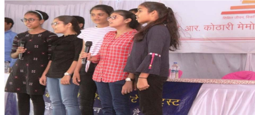
Students singing National Anthem