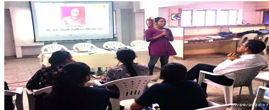
Trust beneficiary briefing about her future